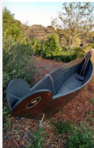
You can go to the Channel Islands by boat. In the past, you had to paddle a boat to get there. Today, boats are fast.