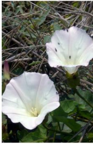
You can see red berries and white flowers.