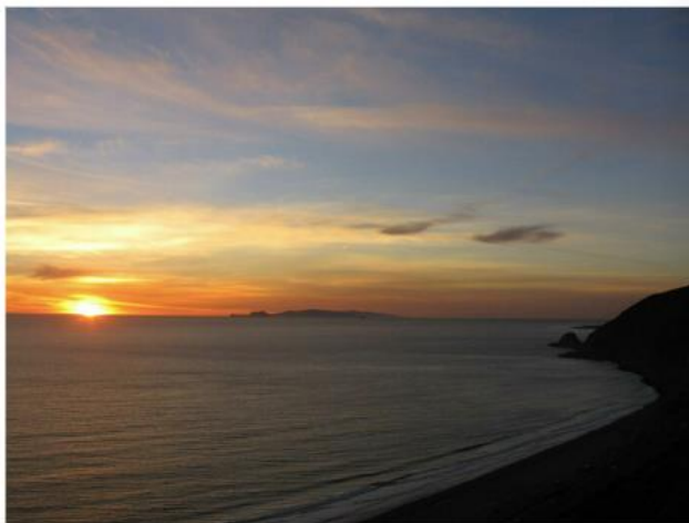
The Channel Islands are off the coast of Southern California. There are 8 islands.

https://www.mixbook.com/photo-books/interests/the-wild-channel-islands-26913955?vk=64fZ2jWrIMhu8VqxsPOP