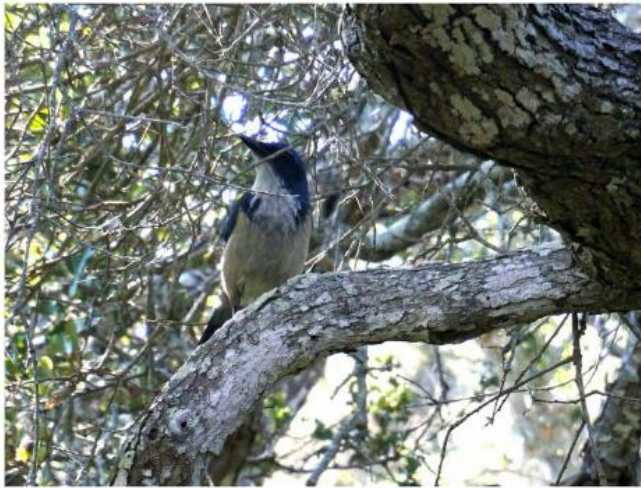
You can see animals that live only on these islands. The island scrub-jay is a bird that lives only on Santa Cruz Island. The island scrub-jay is blue and white.