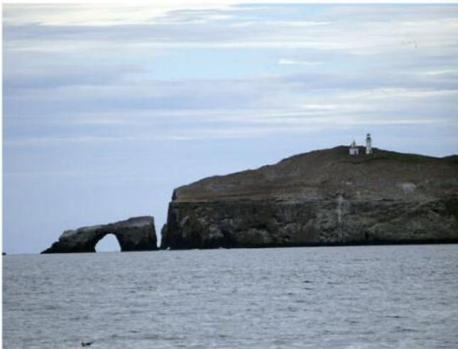
You can see an arch in the rock.