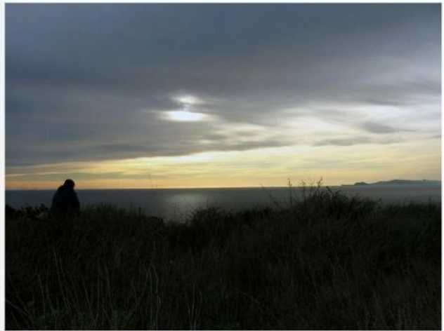
When you come home, you will want to go back.