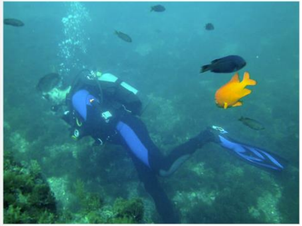
Under the water, you can scuba dive.