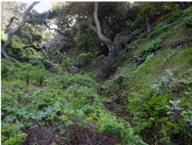
You can see green hills.