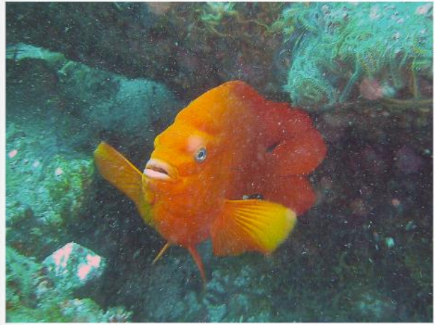
You can see orange fish called garibaldi.