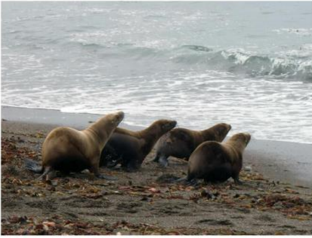
You can see sea lions.