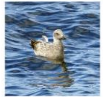
You can see seagulls. Baby seagulls are brown. Adults are white, gray and black. The yellow bill has a little red spot.