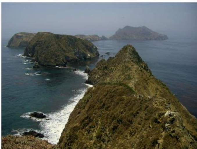
You can see small islands that make up one island.