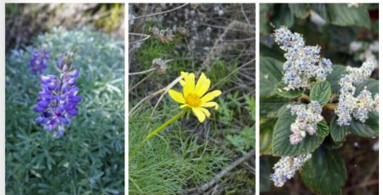
You can see purple, yellow or blue and white flowers.