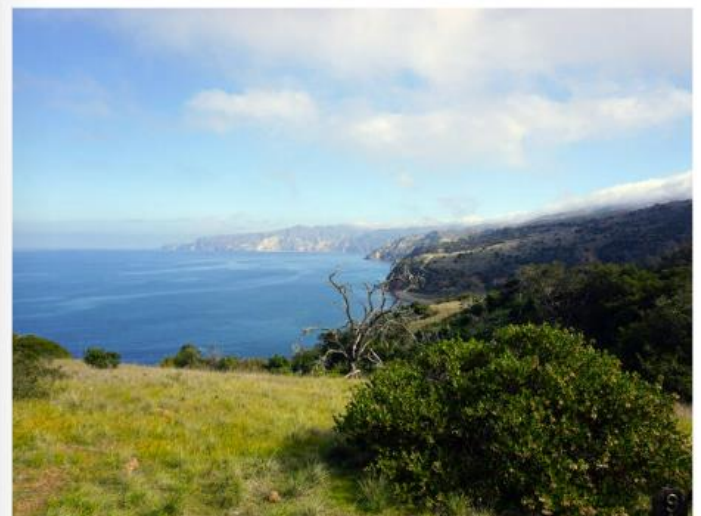
You can hike on Santa Cruz Island. It is the biggest island.