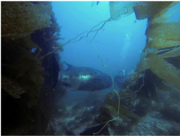
You can see giant sea bass. They are big, black and slow. They never stop growing. If you are very still, you can be with one for a long time.