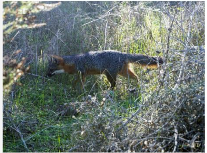
The island fox lives on six islands. Each island has a different kind of island fox. The island fox is gray, red, white and black.