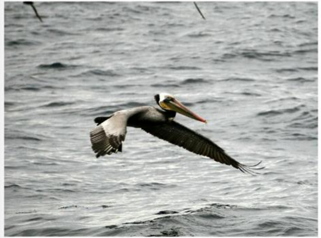
You can see brown pelicans. When they grow up, they are more than just brown. They are also white, yellow, red and orange.