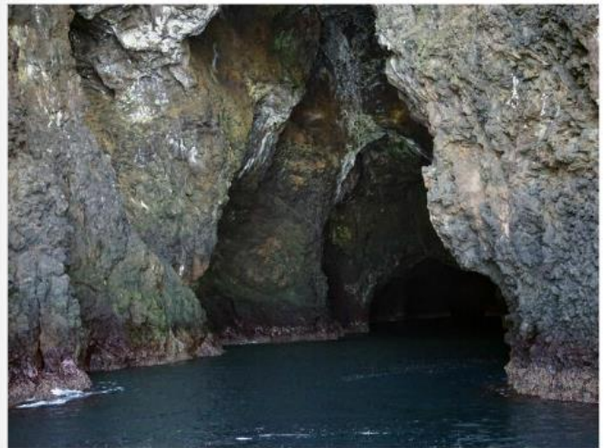
You can see a sea cave.