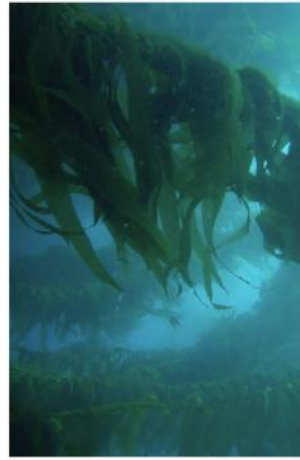
You can see kelp. Kelp is very big seaweed. It grows fast.