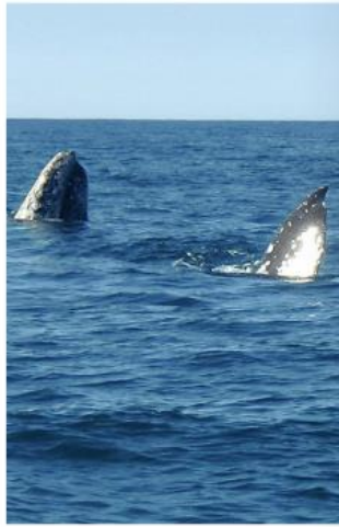
From the boat, you can see dolphins and gray whales.